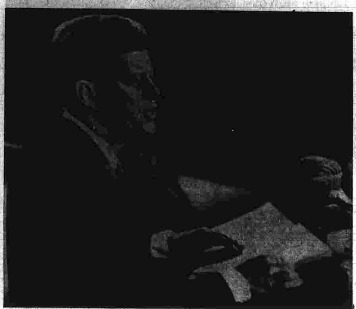
President Kennedy, in written speech before him, delivers his State of the Union address today to a joint session of the Congress assembled in the chamber of the House of Representatives.

The main opposition to Olympio was the French U.N. protectorate when it gained independence in 1960. Before World War I it was a German colony.